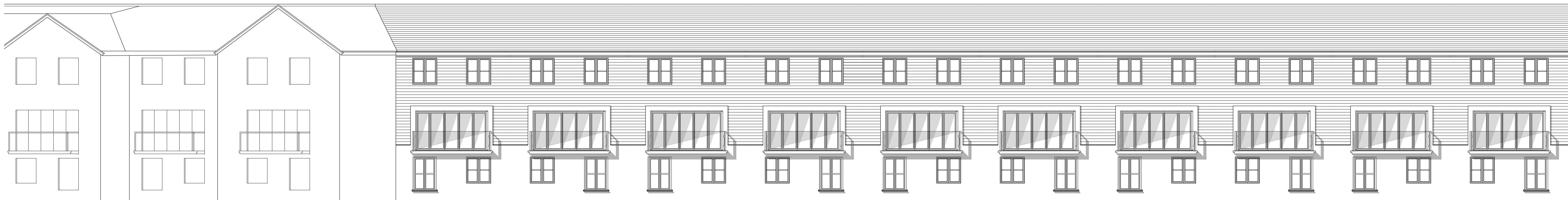
ELEVATION 104 (SOUTH)

Notes: Do not scale from this drawing. Contractor to take and check all dimensions on site before work commences. Discrepancies to be reported to architect. Subcontractors to verify all dimensions on site before making shop drawings or commencing manufacture. This drawing is copyright.