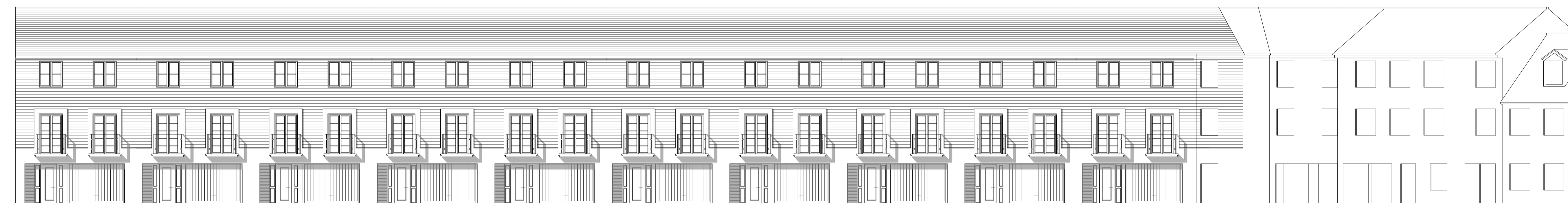
ELEVATION 112 (NORTH)