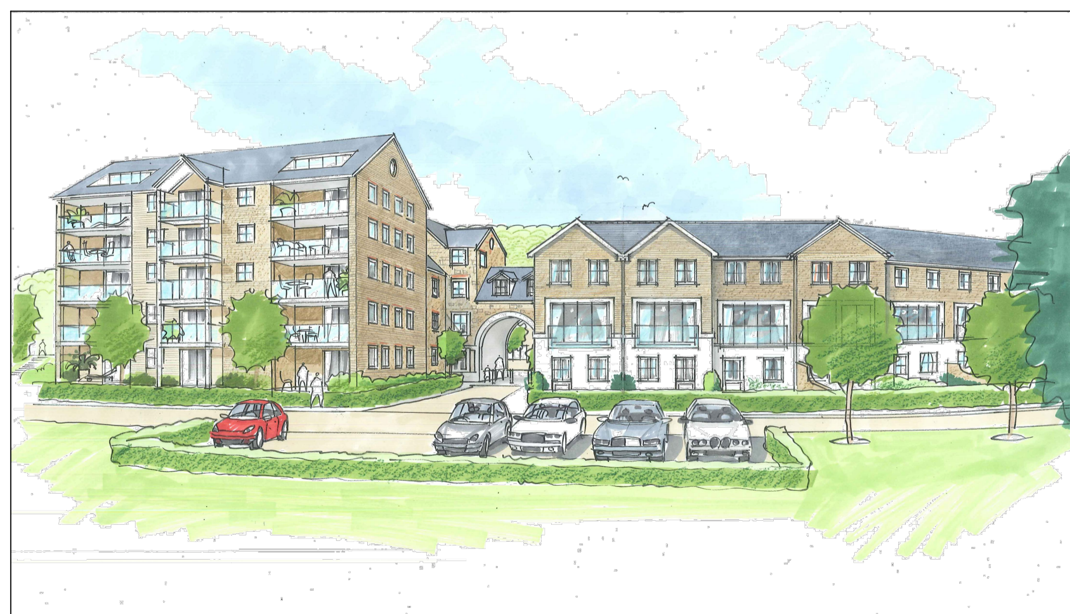
VISUAL OF BLOCK H & G + ARCH