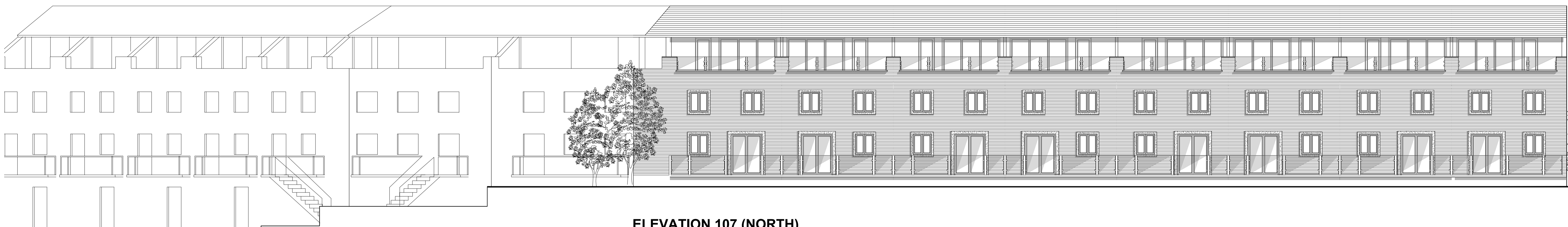
ELEVATION 107 (NORTH)