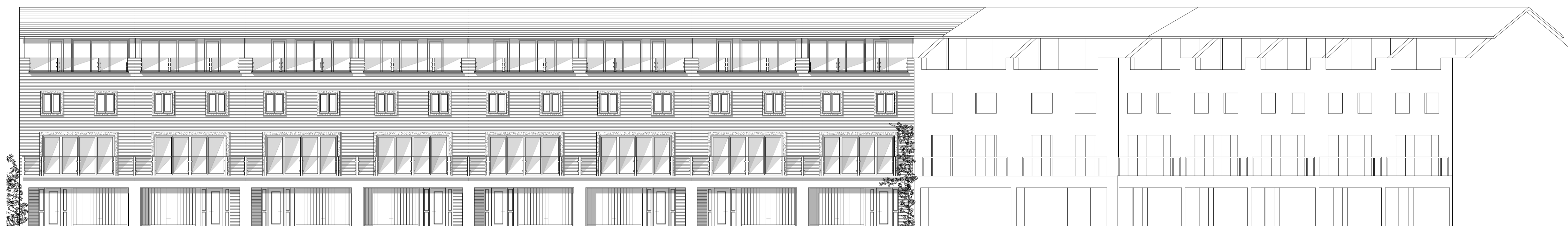
ELEVATION 108 (SOUTH)