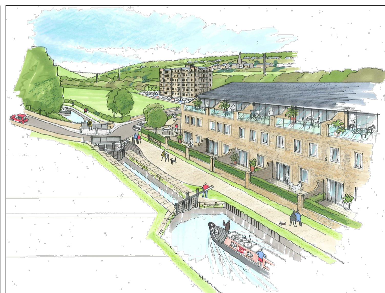
THE CANAL: LOOKING EAST