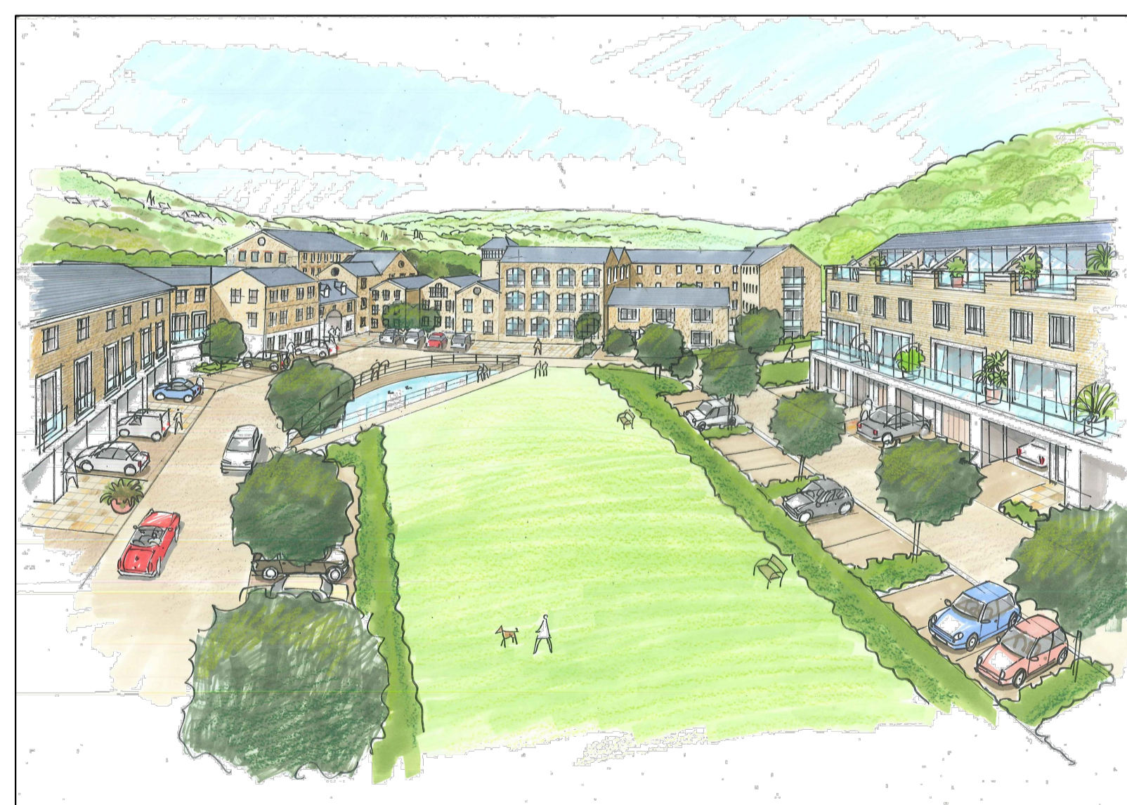
THE GREEN: LOOKING WEST