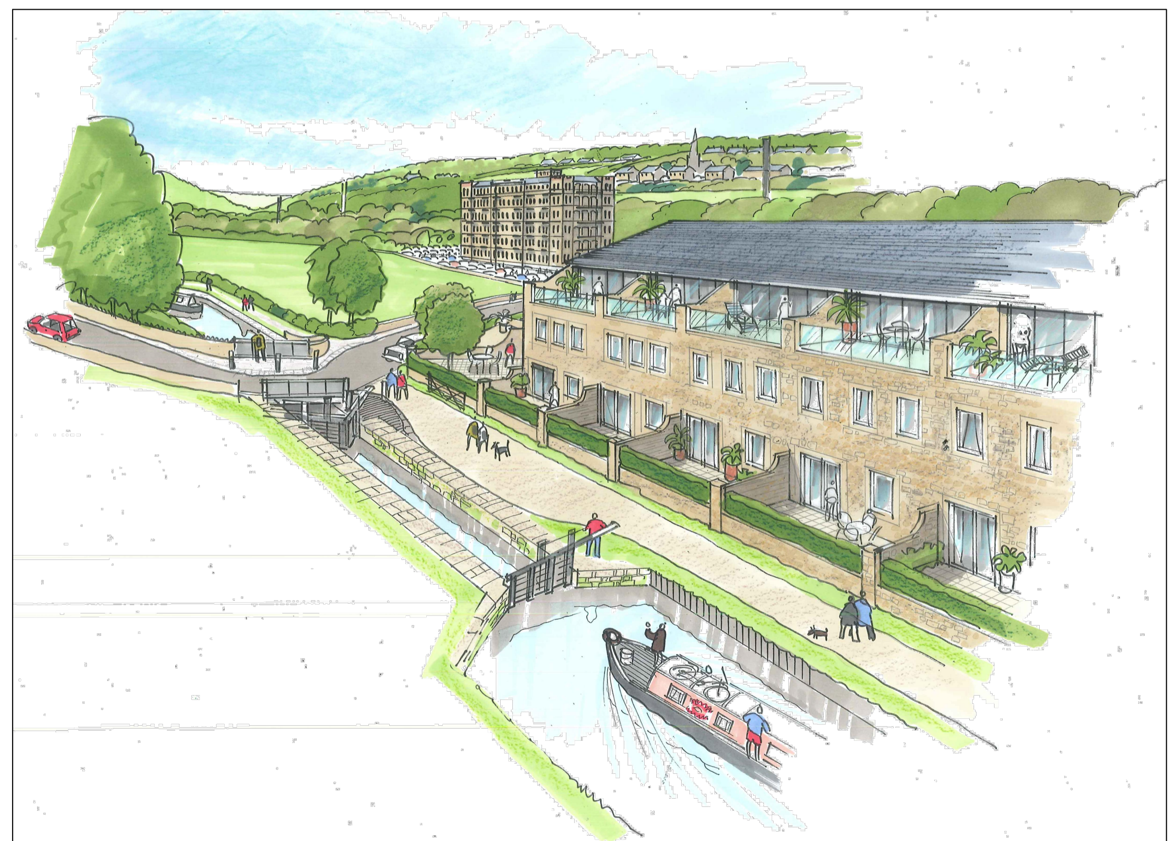
VISUAL OF BLOCK J