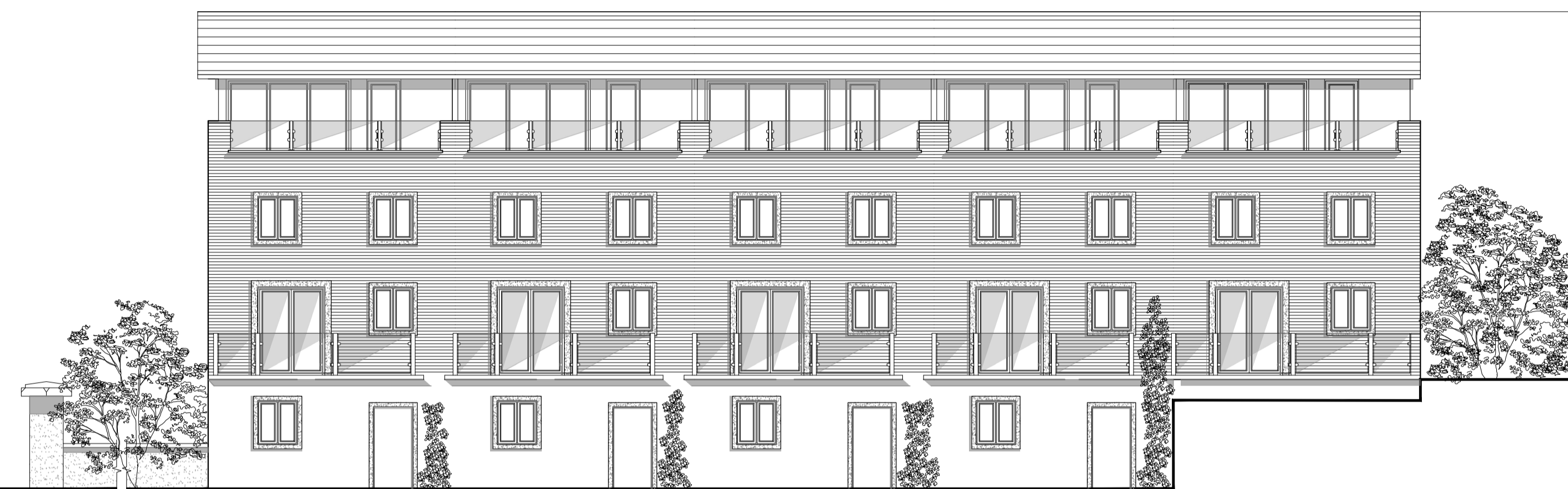
ELEVATION 106 (NORTH/EAST) - BLOCK J