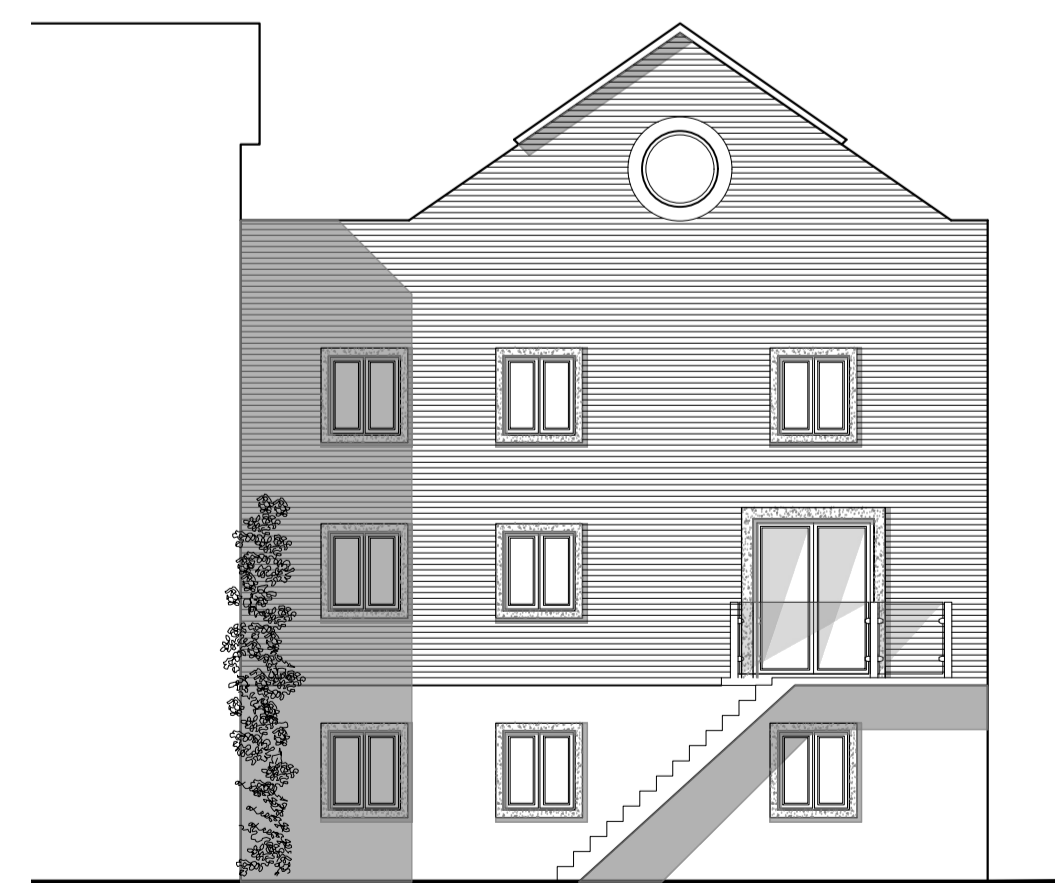
ELEVATION 122 (SOUTH/EAST) - BLOCK K