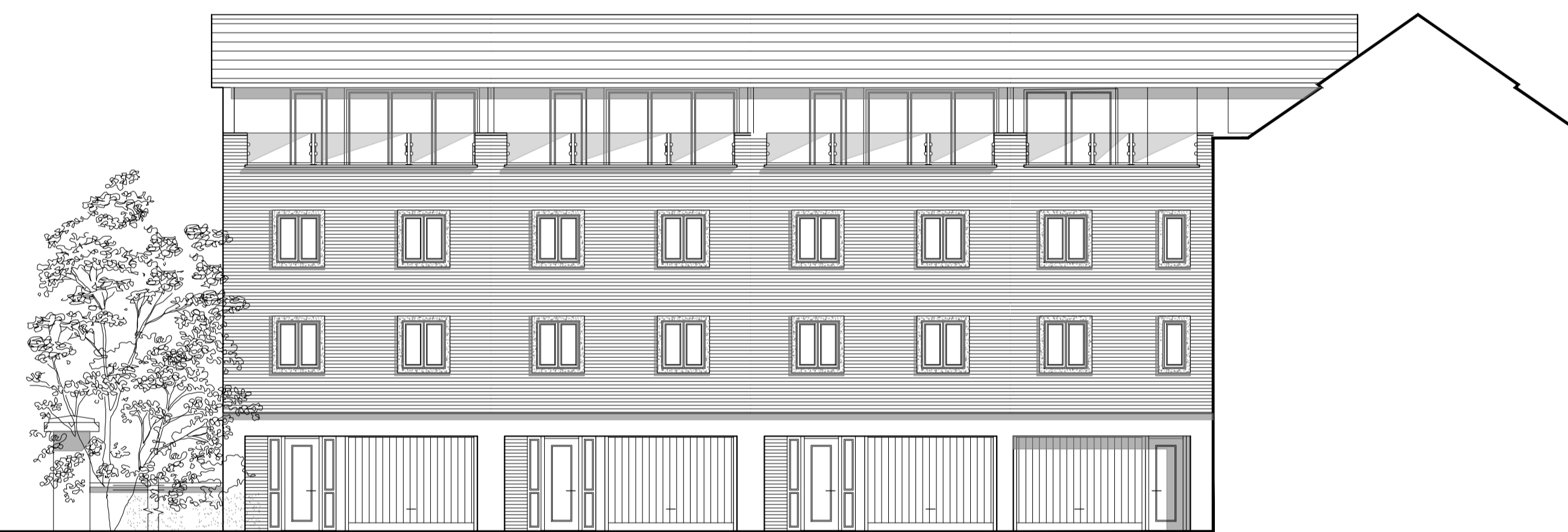
ELEVATION 109 (SOUTH/EAST) - BLOCK K