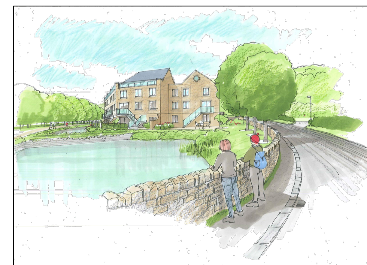
SETTLING POND FROM LOWER WESTWOOD LANE.