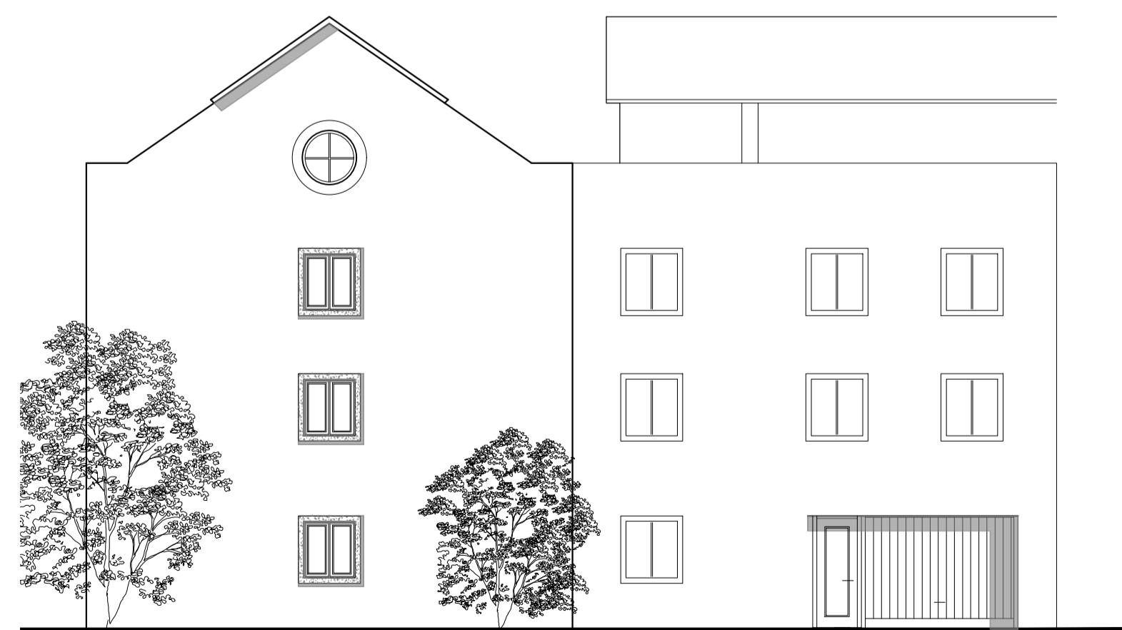
ELEVATION 121 (NORTH/WEST) - BLOCK K