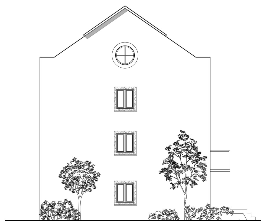
ELEVATION 124 (SOUTH/EAST) - BLOCK J