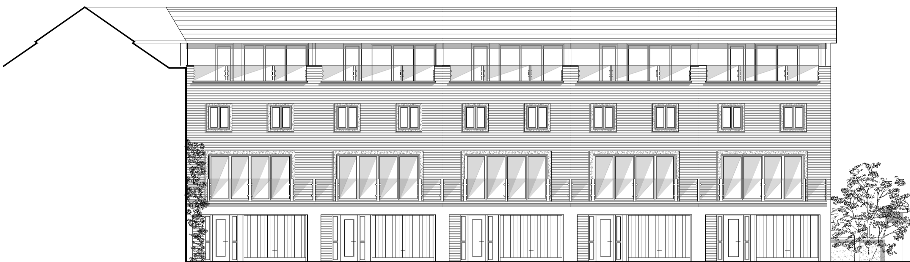
ELEVATION 109 (SOUTH/EAST) - BLOCK J