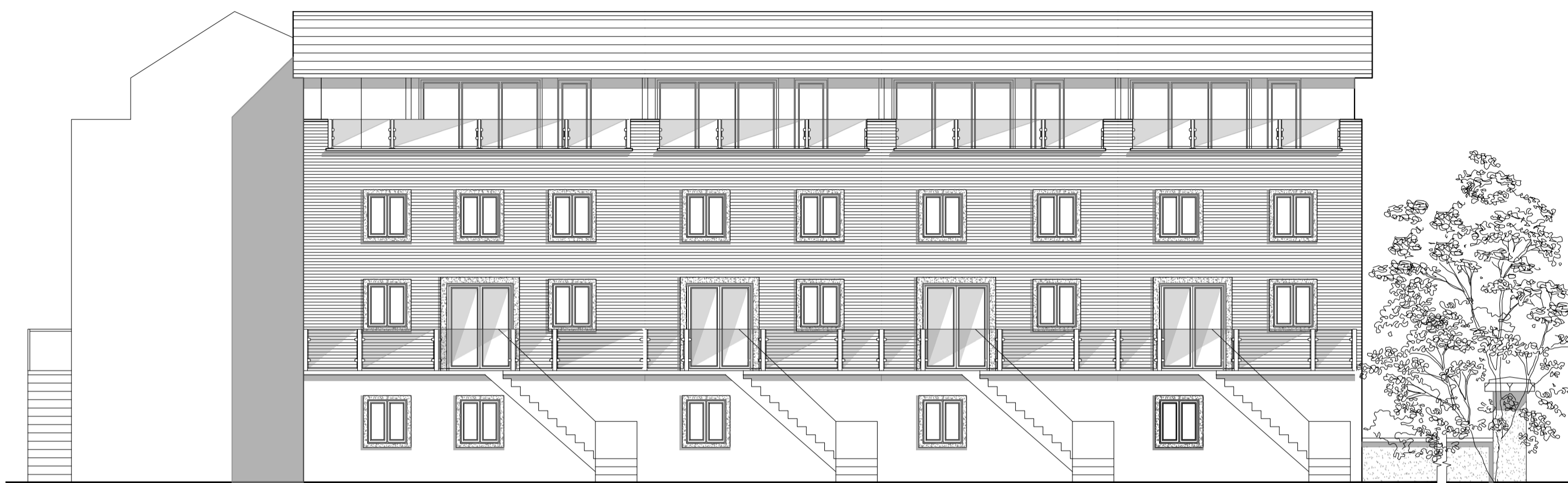
ELEVATION 106 (NORTH/EAST) - BLOCK K