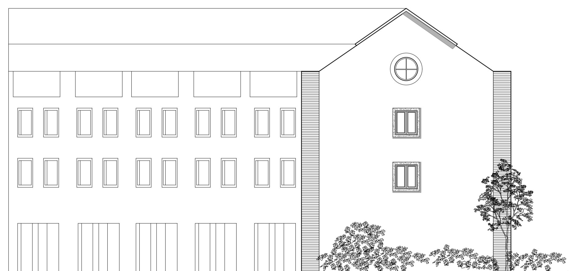
ELEVATION 123 (WEST)