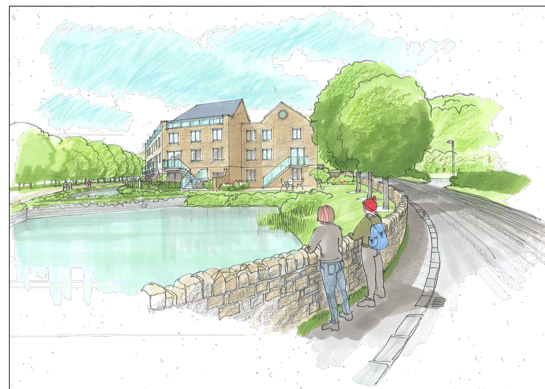
SETTLING POND FROM LOWER WESTWOOD LANE