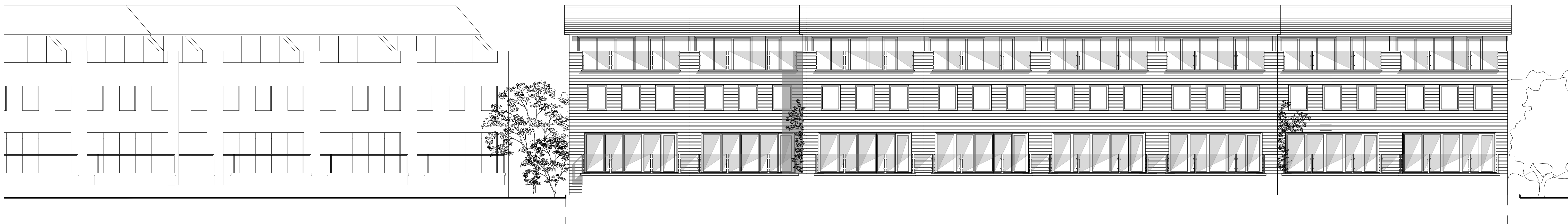
ELEVATION 115 (NORTH)