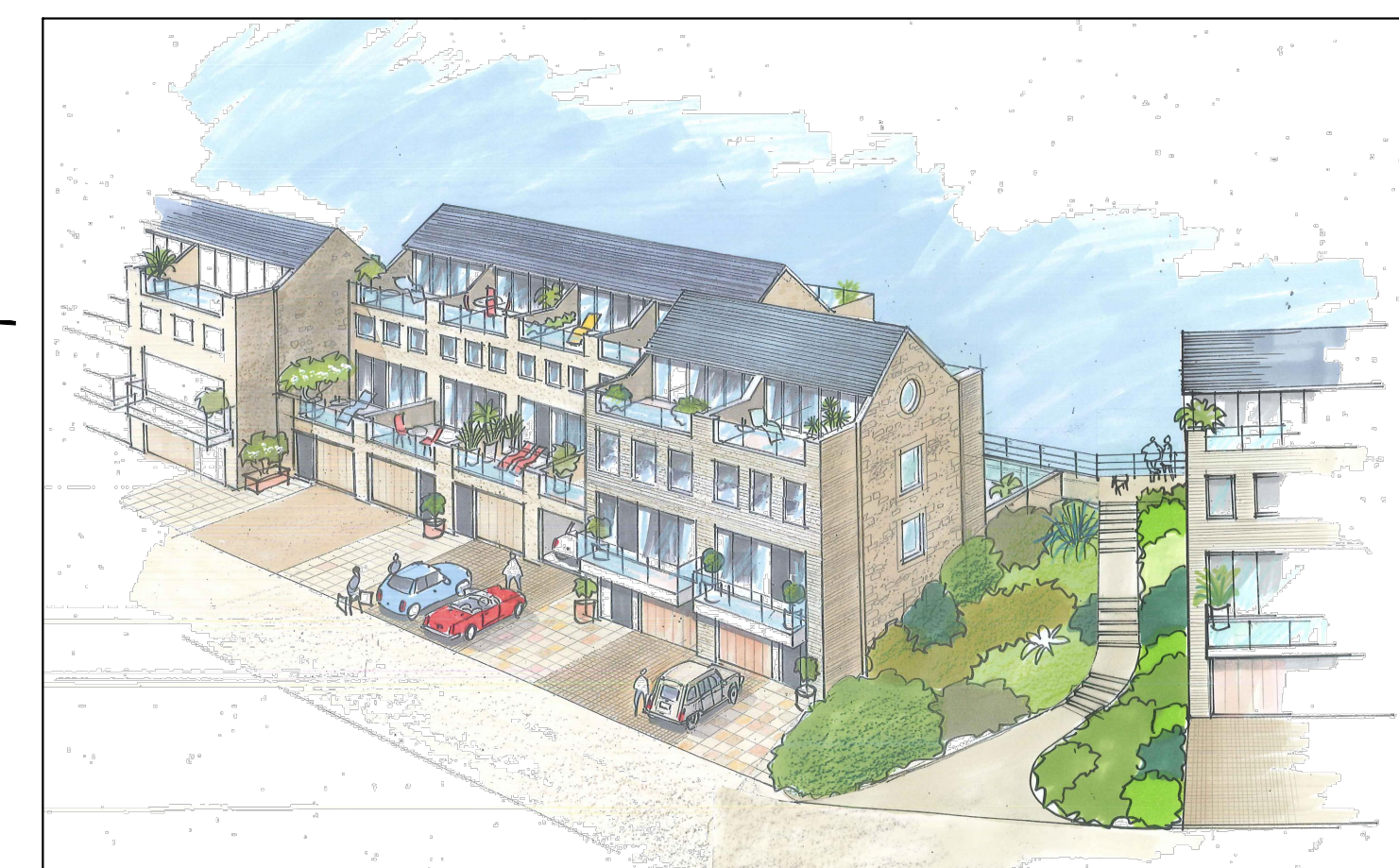
VISUAL OF BLOCK i (PHASE 2)