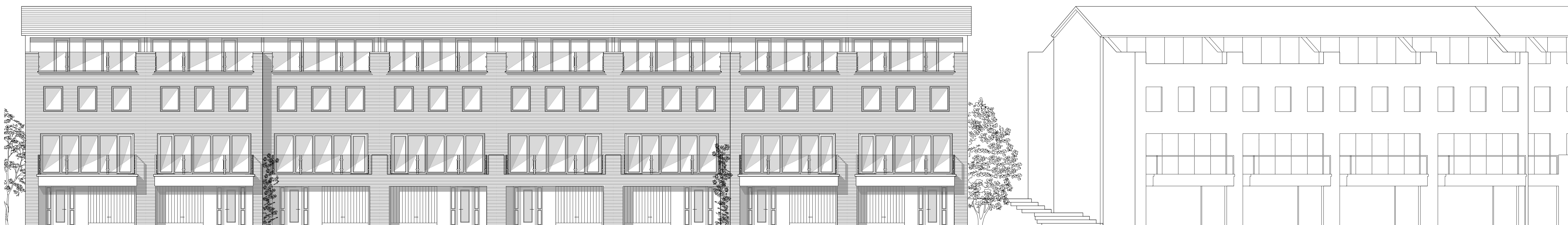
ELEVATION 101 (SOUTH)