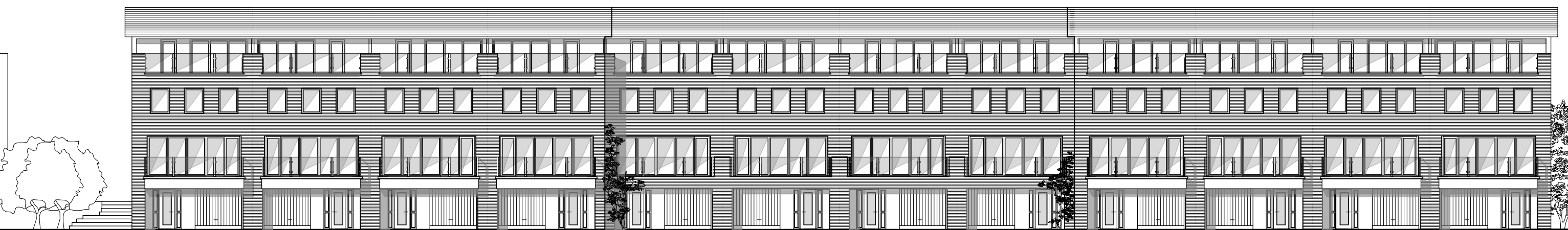
ELEVATION 102 (SOUTH)