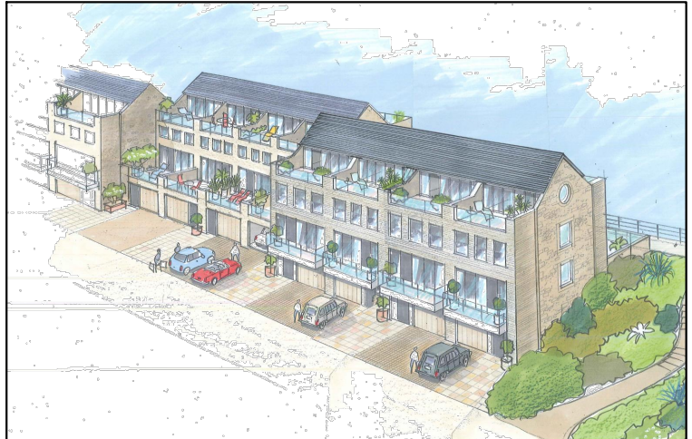
VISUAL BLOCK i (PHASE 1)