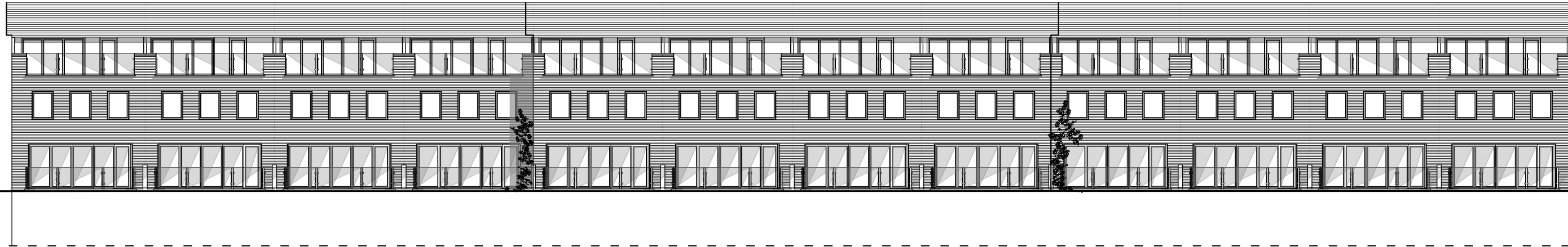
ELEVATION 114 (NORTH)