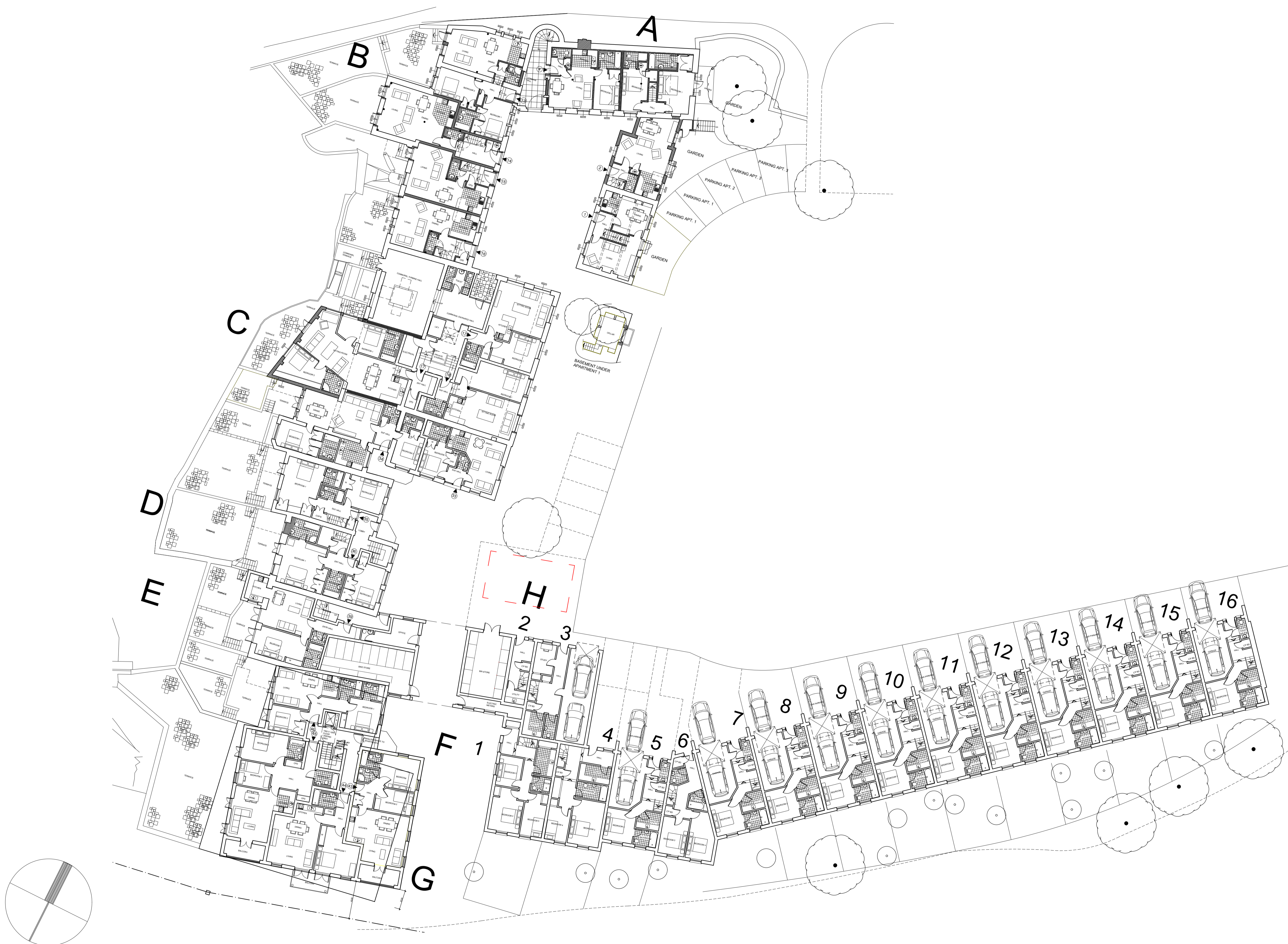
WESTWOOD MILL, LINTHWAITE - GROUND FLOOR BLOCK A-H

Notes: Do not scale from this drawing. Contractor to take and check all dimensions on site before work commences. Discrepancies to be reported to architect. Subcontractors to verify all dimensions on site before making shop drawings or commencing manufacture. This drawing is copyright.