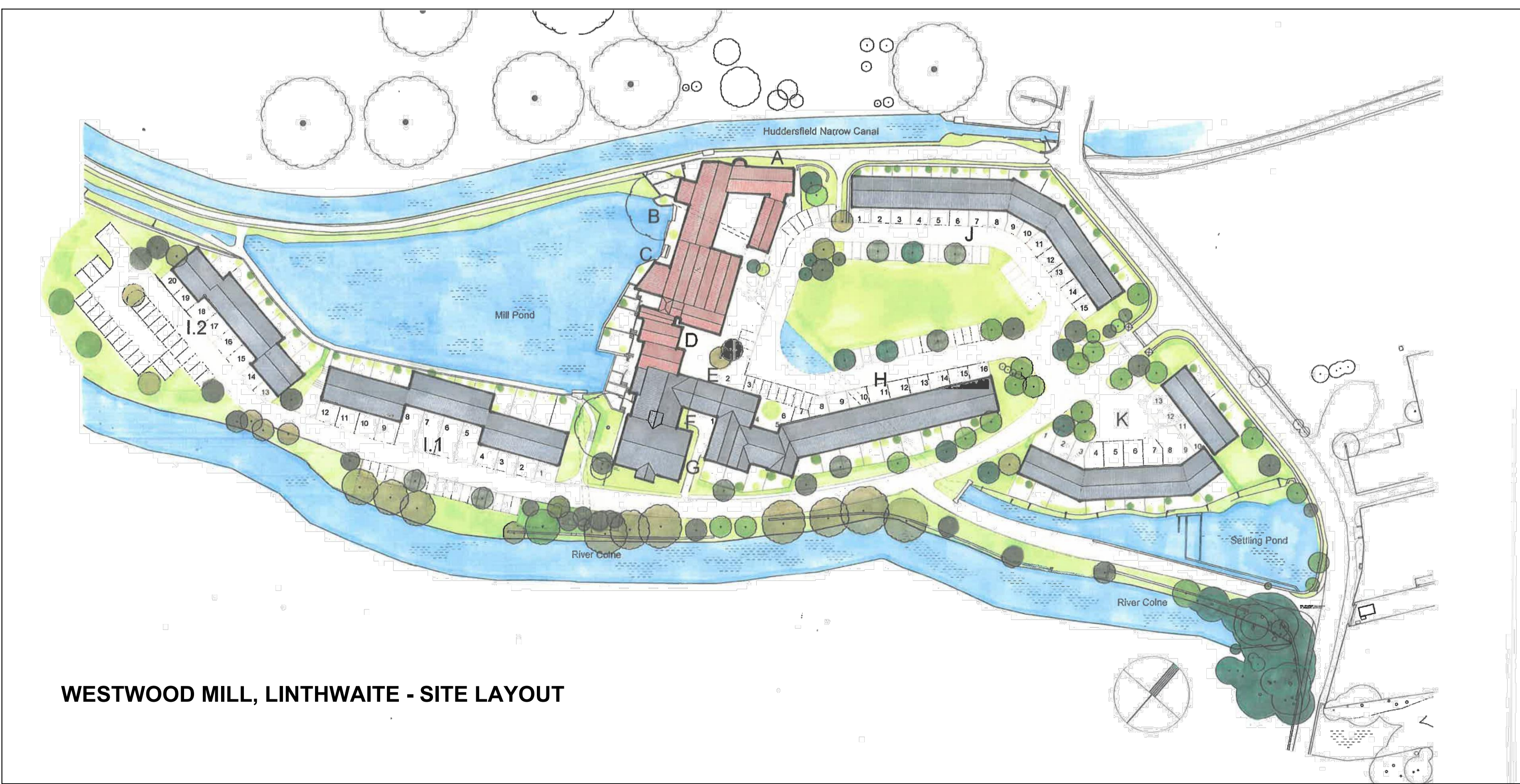
WESTWOOD MILL, LINTHWAITE - SITE LAYOUT

Resident Parking Space Visitors Parking Space. To be permeable shingles/ grass crate type material