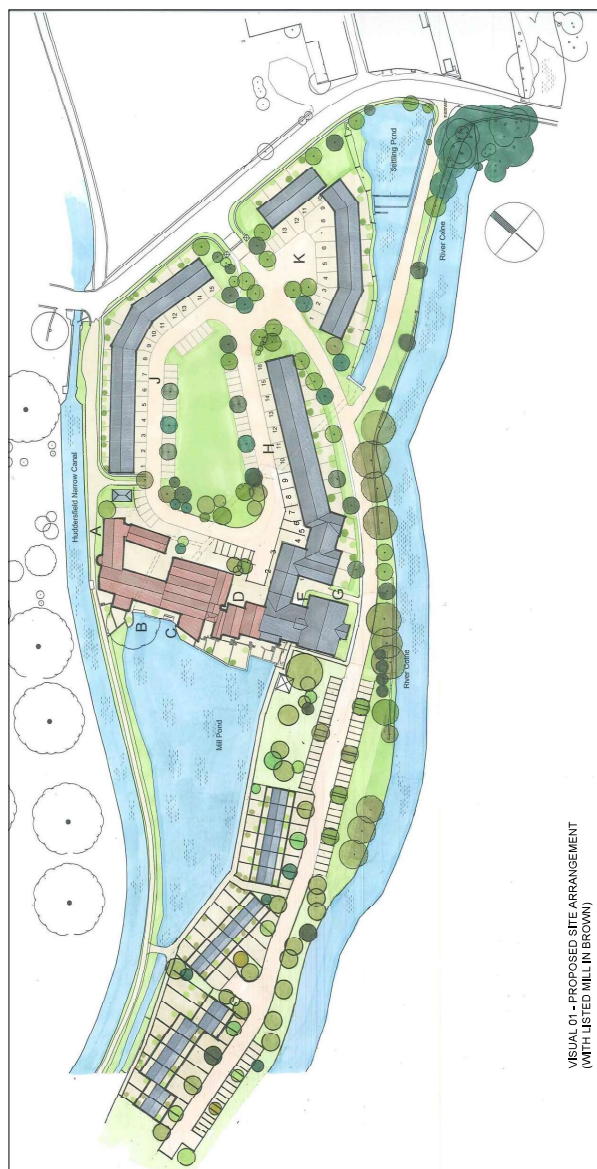
VISUAL 01 - PROPOSED SITE ARRANGEMENT (WITH LISTED MILL IN BACKGROUND)

Client: WESTWOOD WILSON LTD. Project: WESTWOOD MILL LINTHWAITHE Title: SITE ARRANGEMENT & OVERALL SITE PLAN Date: 02/10/2021 Drawn: [Name] Checked: [Name] No. 538.02/PLA04 M